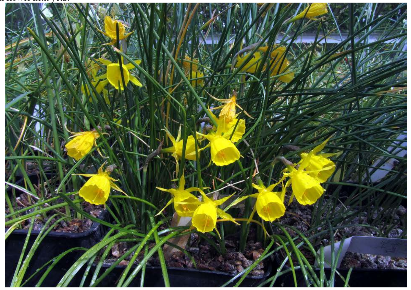
One still in full growth where I removed a glass pane is this pot of seedlings from Narcissus bulbocodium.

There is no point in trying to water bulbs in an attempt to get them to grow on once the leaves start to turn yellow in fact it is dangerous to do so. Once the bulbs start to go into dormancy they will not change their mind and adding water which will not be used by the plant can cause the bulb to rot. Despite the fact that if I had been home I could have kept the growth going for a while longer, most of these bulbs have had a good growing season and should all still flower next year.