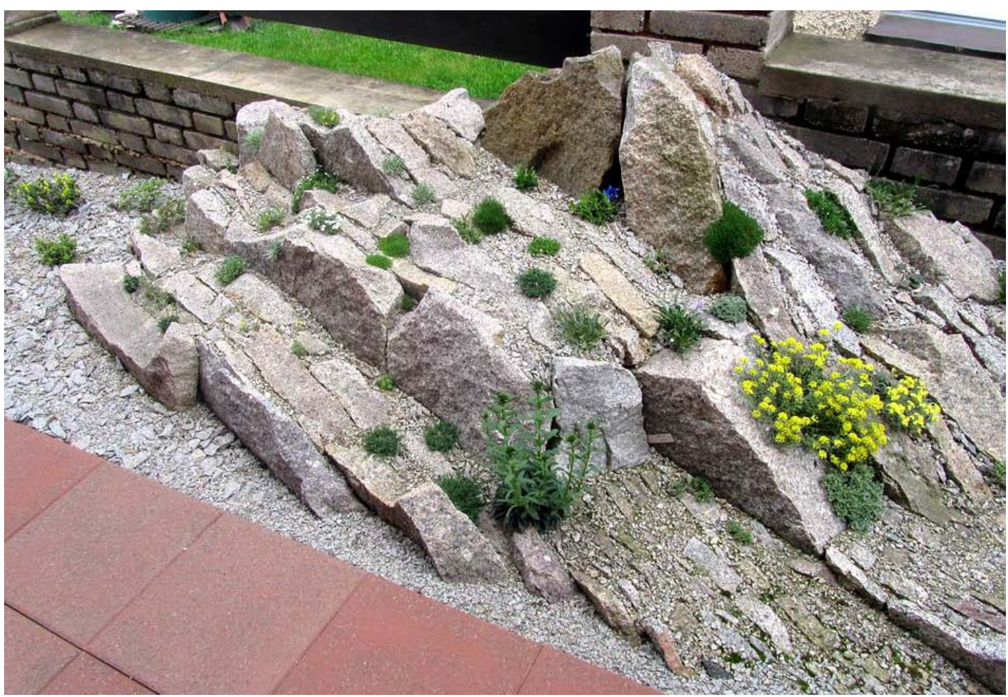
Petr Divis only caught the 'Rock Garden Bug' a few years ago but has already created a fantastic series of rock garden beds, using, granite that show outstanding skill and artistry in the placing of rocks. I have always said in my trough workshops that you should be bold with the rocks and place them to look good before you add any plants – then you can further enhance the effect with plant highlights – that is well illustrated here.