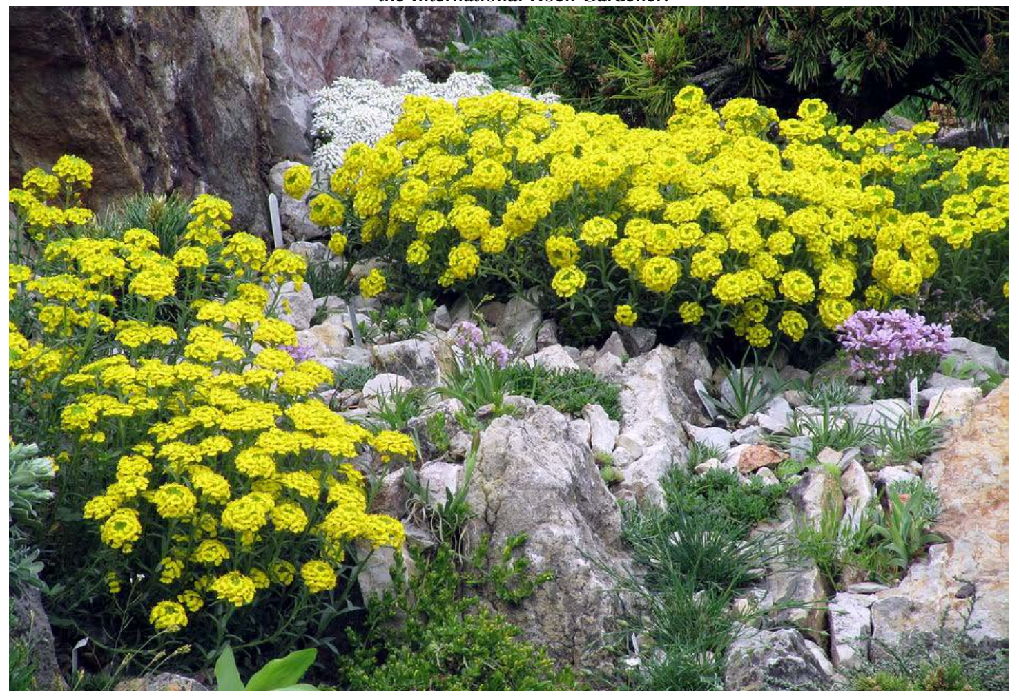
This vignette from the garden of master seed collector and explorer Vojtech Holubec.