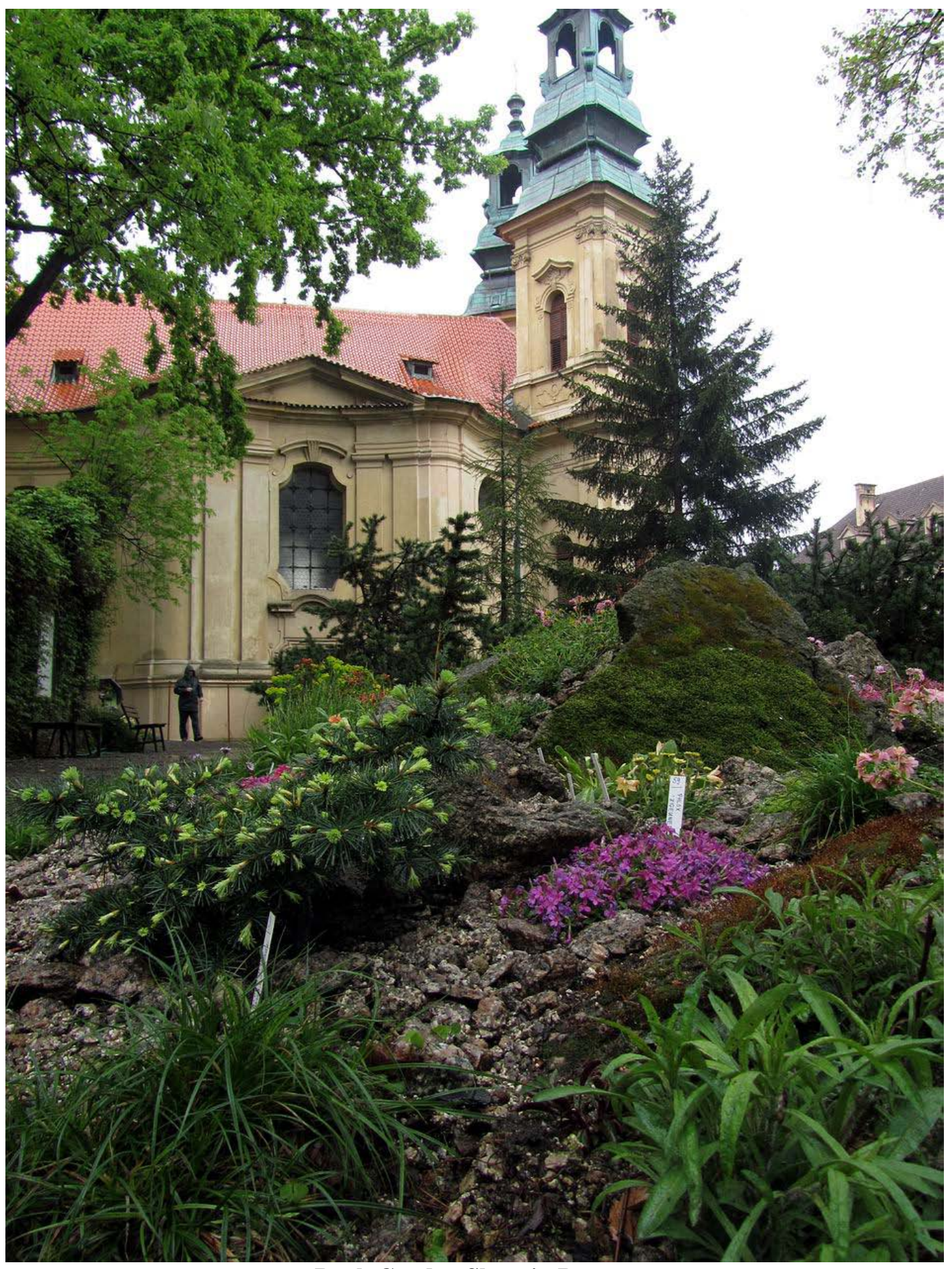
Rock Garden Show in Prague

BULB LOG 20...... 15<sup>th</sup> May 2013