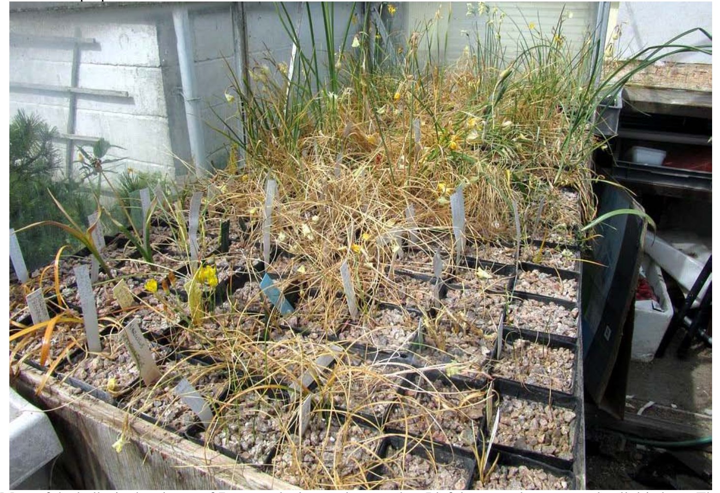
Most of the bulbs in the plunge of 7cm pots had green leaves when I left but now they are nearly all dried out. The few at the far end that are still green are Narcissus.

The Ornithogalum leaves have gone for this year but the flowers are only coming out now extending the flowering season in the prop-house.