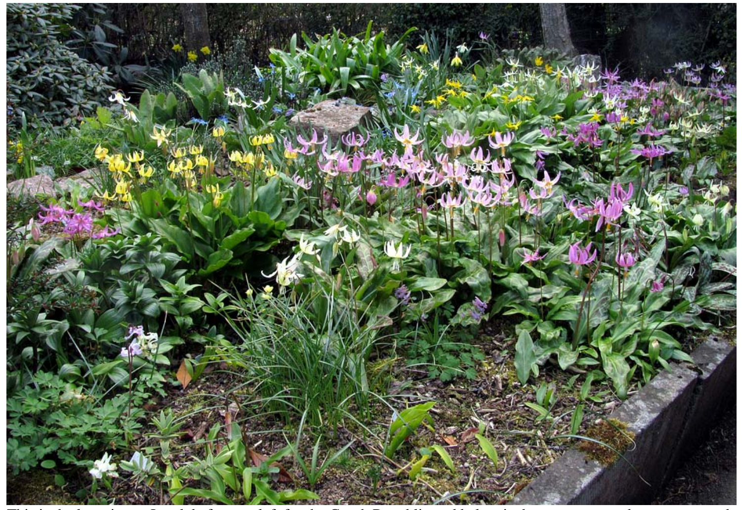
This is the last picture I took before we left for the Czech Republic and below is the same scene when we returned.