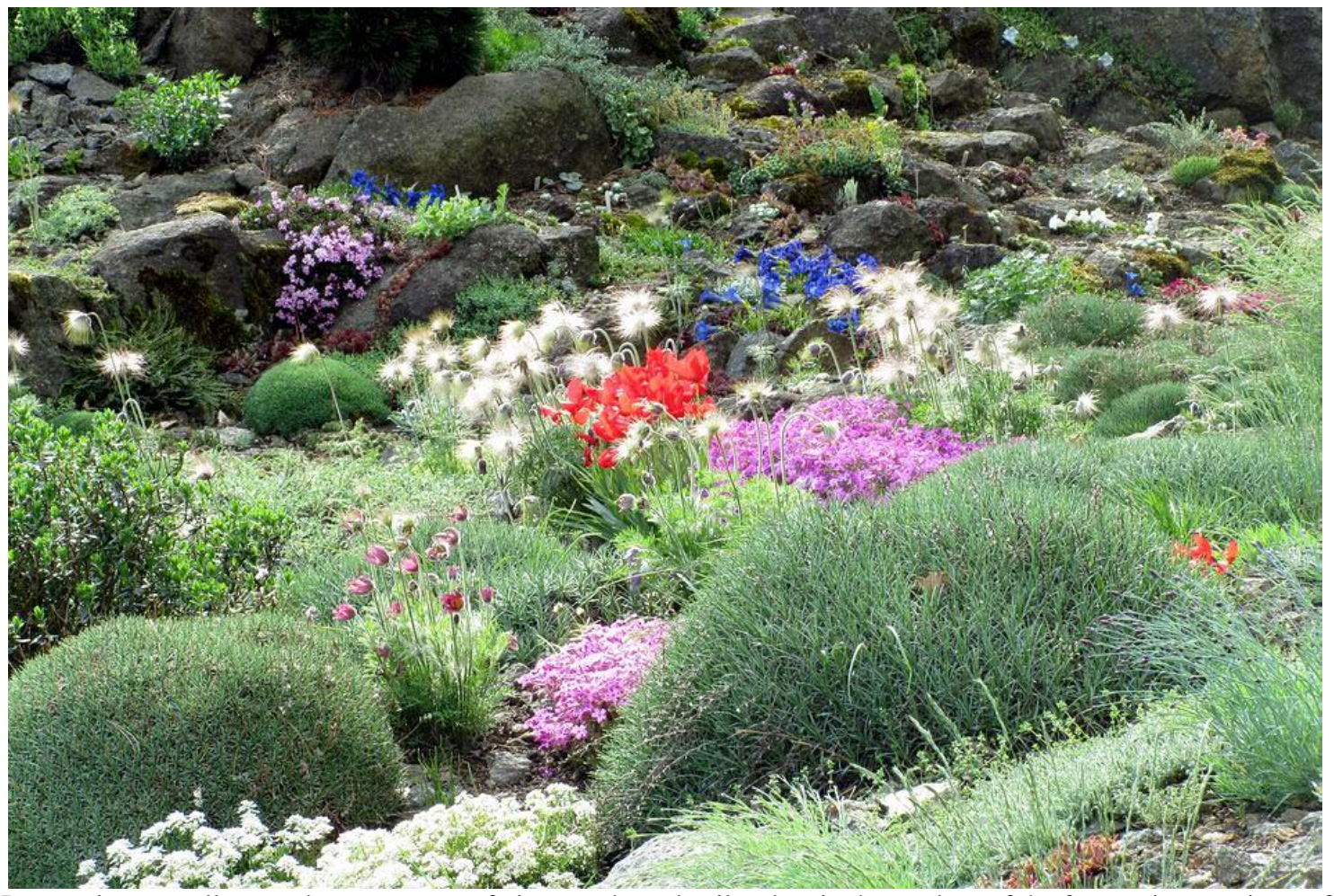
Just to give a small taster the next group of pictures show details taken in the gardens of the four main organisers of the entire event. Above is a colourful scene at the 'Beauty Slope' the garden of Zdenek Zvolanek, joint Editor of the International Rock Gardener.