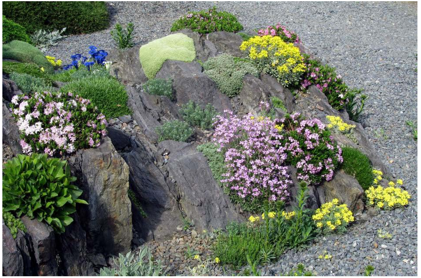
A tiny section of the extensive and expanding series of rock beds in the garden of Jiri and Ludmila Papousek.